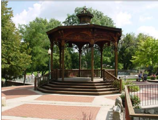
Pictured left: The Famous Fenton Gazebo located in the park downtown near city hall. The gazebo is the central meeting

It's been six months since the initial I Joined! training and we're 34% of the way through the 560 Lions, Lioness and Leo Clubs across the state. Seventy-nine Lions Clubs across the state have scheduled their programs, and 112 clubs have already received the program!